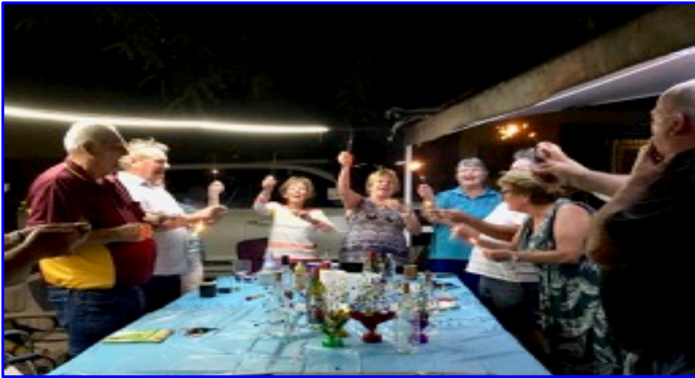
Happy New Year!