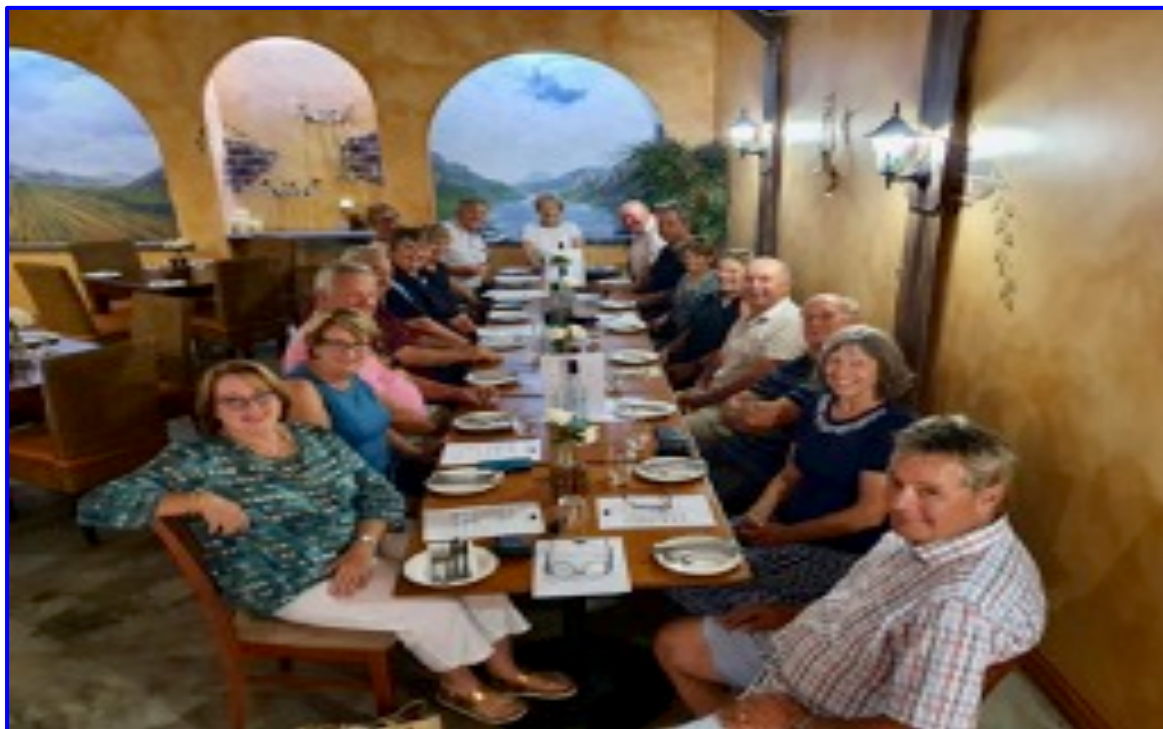
Sandgroppers wining and dining at the Old Fig Tree Restaurant in the Swan Valley

The wind is about to come up so it's back to the vans to bring in awnings. A quiet evening. Saturday morning; no morning tea as we have a booking at the Fig Restaurant 500 metres down the road. What delicious food, great venue behind some vineyards. Air-conditioned and very good service.