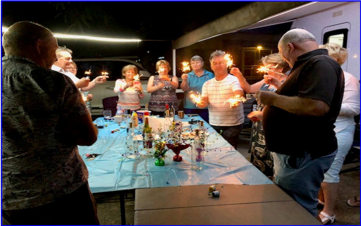
Sandgropers celebrating New Year in style!