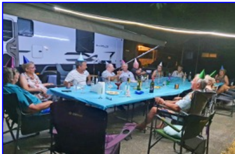
Sandgropers with party hats on waiting for the countdown to Midnight